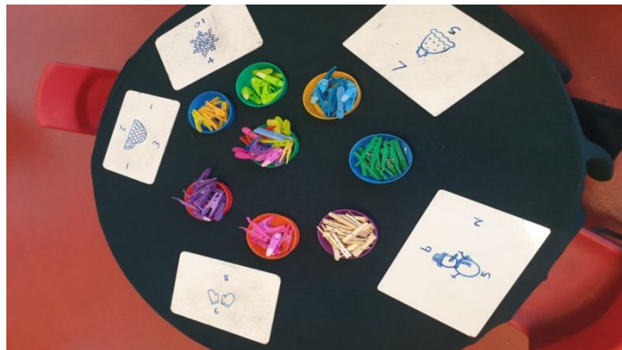
Winter numeral and quantity