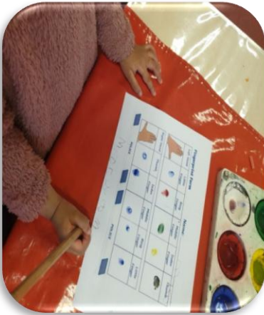
Exploring Finger prints

Police Visit: The police spoke to the children about what number to call when they need help (999), how to safely cross the roads and what to do when a stranger approaches them. They also gave the children a chance explore their equipment.