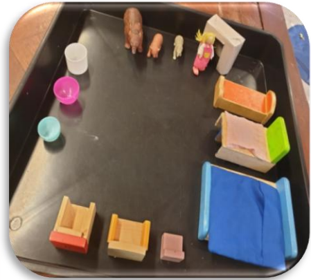
Small World set up