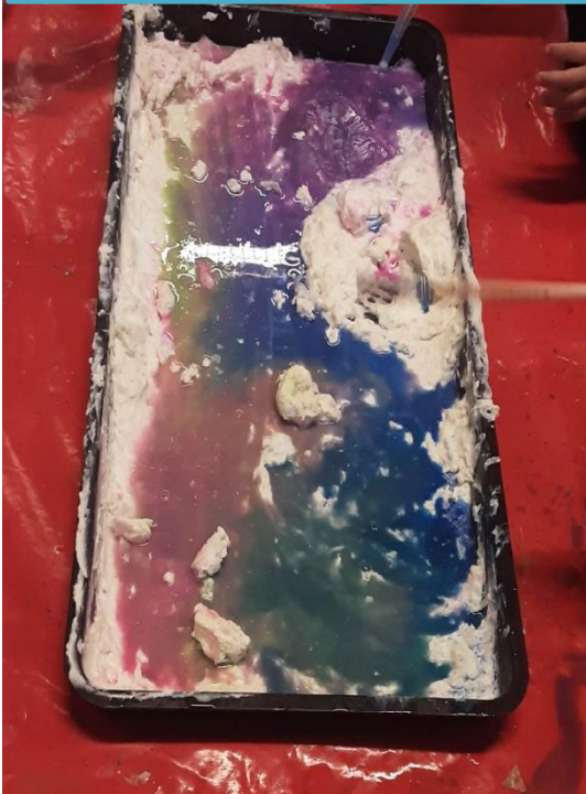
Soap Shaving with colour mixing

Discovering and experimenting ways in which glow in the dark slime is put into action.