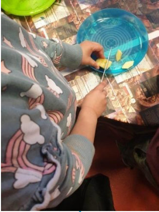
Making apple crumble

We explored the season of winter through various activities to help children understand the change of weather.