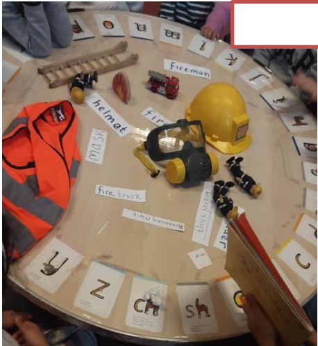
Fire fighter Role play