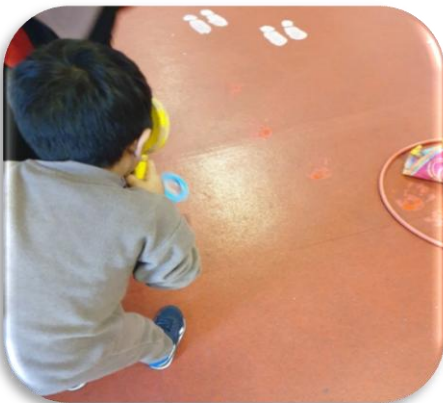
Crime Scene Investigation