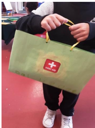
Making first aid Kit